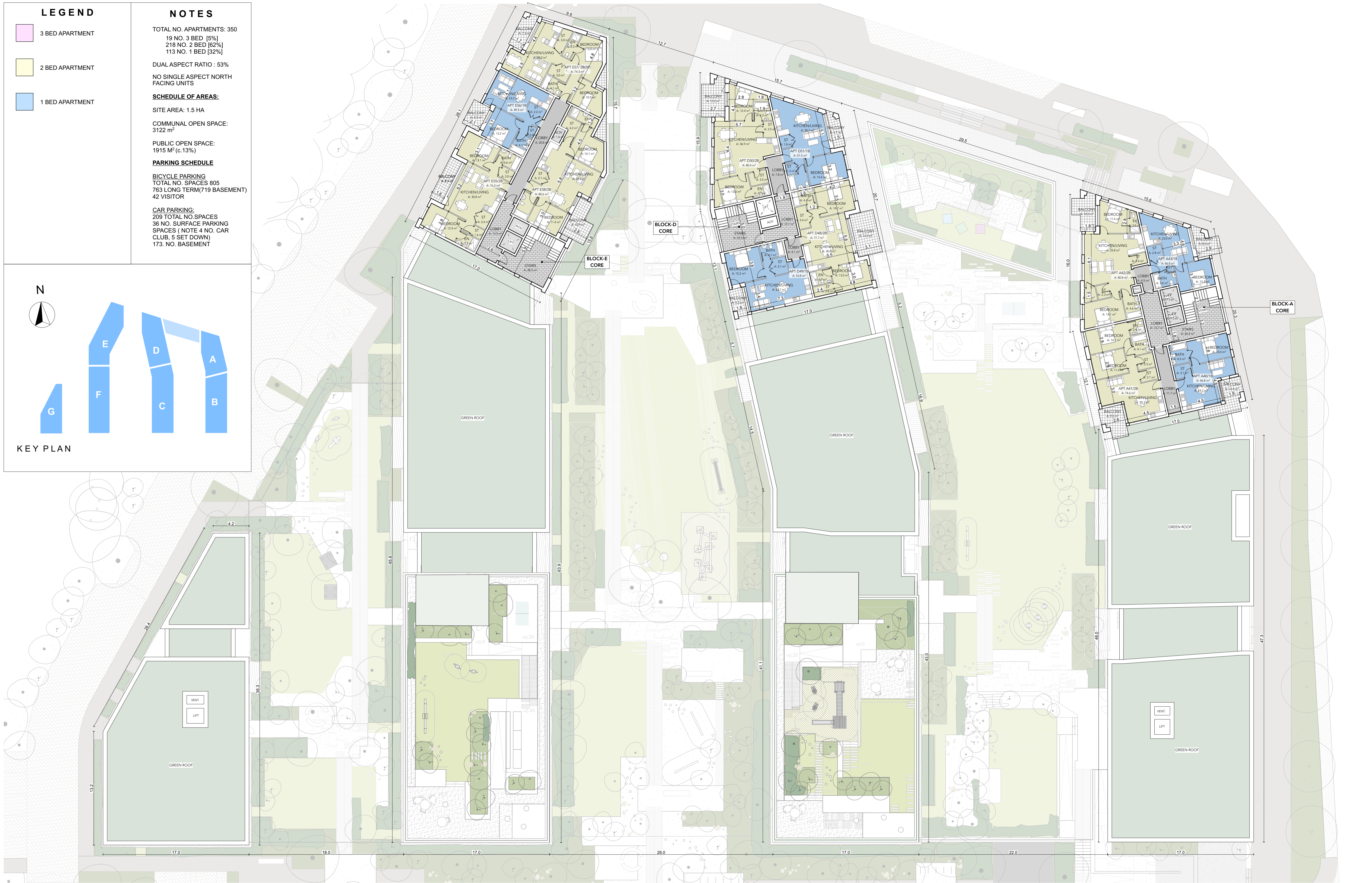
Ninth Floor Plan SCALE : 1:200